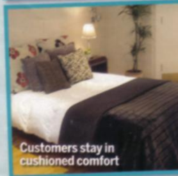
Customers stay in cushioned comfort