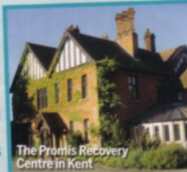
The Promis Recovery Centre in Kent